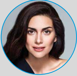
BERGÜZAR KOREL 1001 Nights, Karadayı, Wounded Love