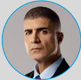
ÖZCAN DENİZ Evermore, A part of Me, Waiting For You