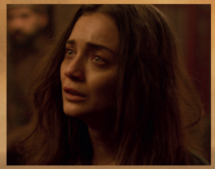
VOICE OVER BY CHARLES DANCE (GAME OF THRONES)