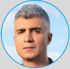
ÖZCAN DENİZ Evermore A Part of Me